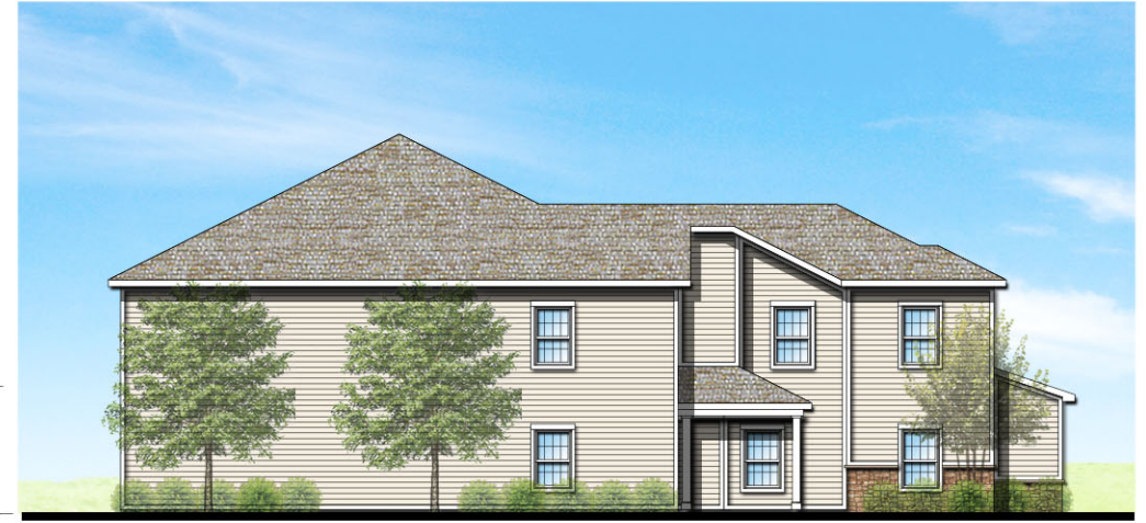
② 8-UNIT SIDE ELEVATION SCALE: 1/8"=1'-0"

Roof Bearing 117'-10" Second Floor Elev. 110'-2" First Floor Ceiling 109'-0" First Floor Elev. 100'-0" Grade 99'-8"