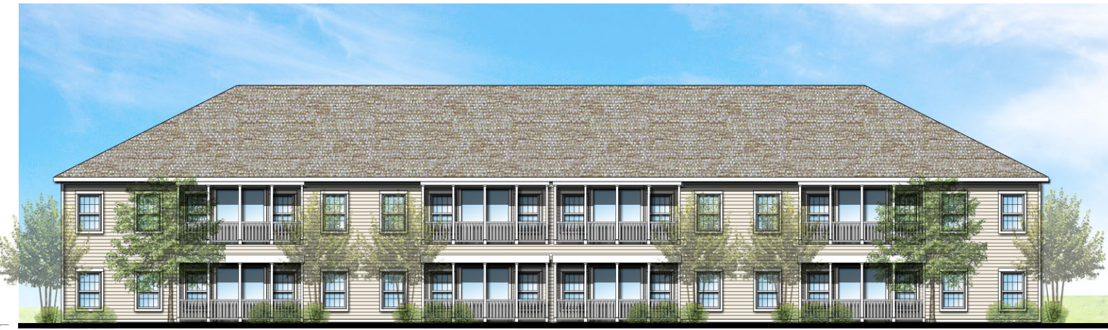
① 8-UNIT REAR ELEVATION SCALE: 1/8"=1'-0"

Roof Bearing 117'-10" Second Floor Elev. 110'-2" First Floor Ceiling 109'-0" First Floor Elev. 100'-0" Grade 99'-8"