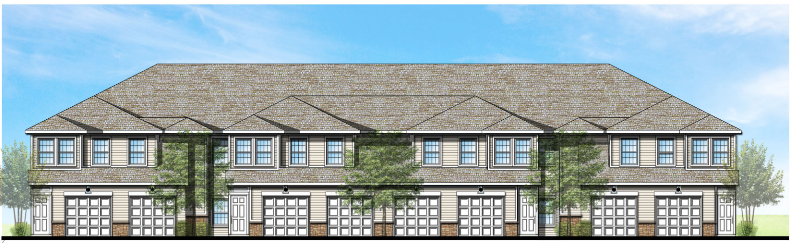
③ 8-UNIT FRONT ELEVATION SCALE: 1/8"=1'-0"

Roof Bearing 117'-10" Second Floor Elev. 110'-2" First Floor Ceiling 109'-0" First Floor Elev. 100'-0" Grade 99'-8"